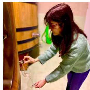
Clockwise from top left: Javier Sanz, Yllera, Uvas Felices, Viñas Murillo, Bodegas Naia, Valdecuevas, Bodega Protos