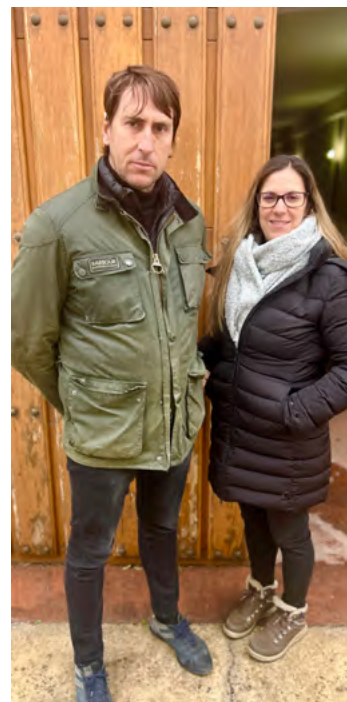
Clockwise from top left: Ángel Lorenzo Cachazo, Rodríguez y Sanzo, Bodega Muelas, Miguel Arroyo Izquierdo, Campo Eliseo, Álvarez y Díez, Martinsancho