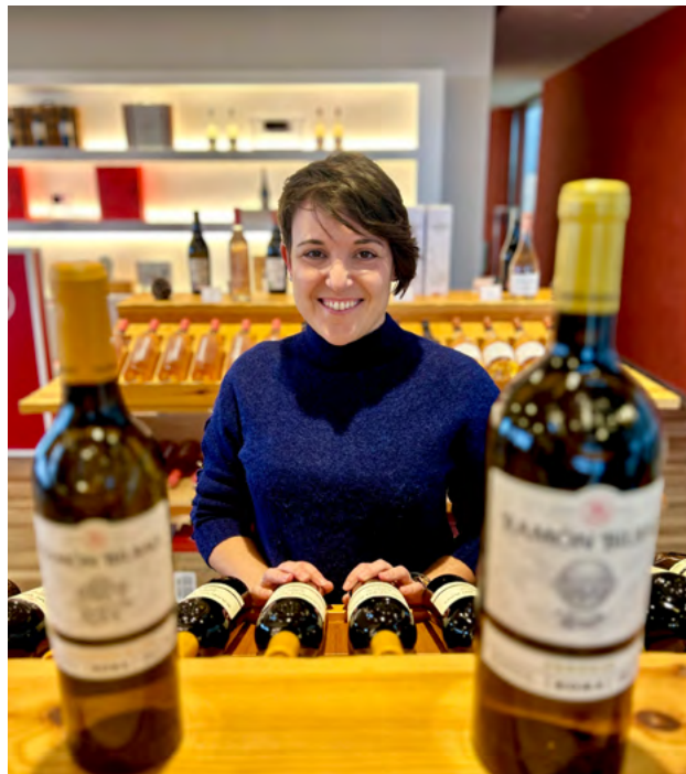
Clockwise from top left: Rodríguez y Sanzo; Beronia; Bodega La Soterraña; Ramón Bilbao; Viñas Murillo