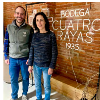
Clockwise from top left: Bodegas Naia; Protos; Belondrade y Lurton; De Alberto; Bodega Cuatro Rayas; Bodegas Pita; Bodegas Yllera